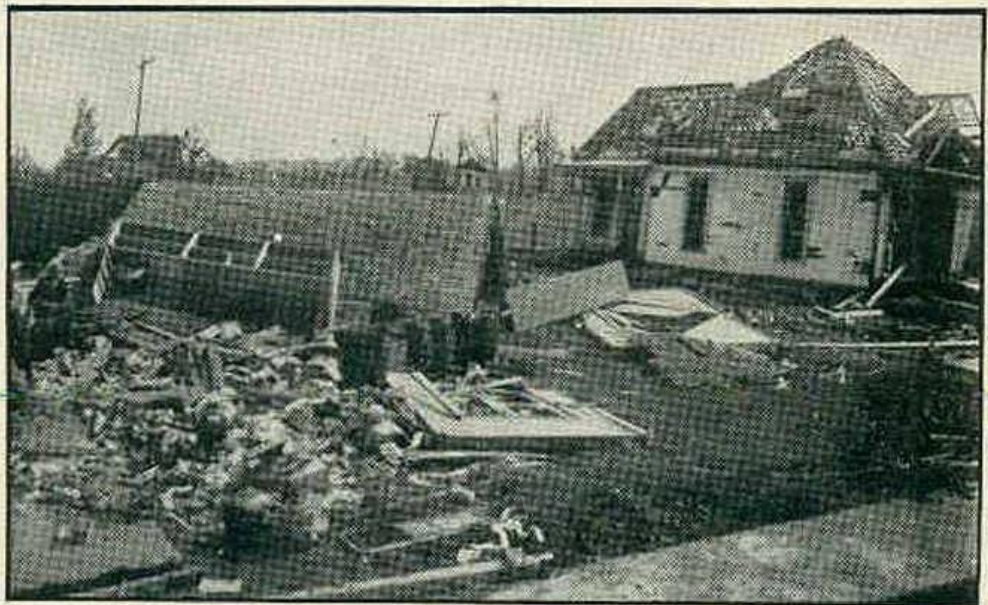
Scene, Corner of 13th Street and Platt, Mattoon. TORNADO AT MATTOON, ILL., which killed 216 people, 54 of these at Mattoon. 500 injured at Mattoon, and property loss $5,000,000.

On May 26, 1917 a devastating tornado hit Coles County tearing through Mattoon at 3:26 pm before heading to Charleston at 40 mph and causing similar destruction, injuries and fatalities, as can be seen below.